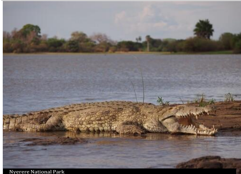
Nyerere National Park