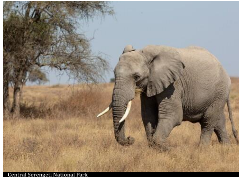
Central Serengeti National Park