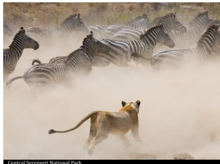
Central Serengeti National Park

→ Breakfast, Lunch & Dinner → Beer and wine → Drinking water → Non-alcoholic drinks