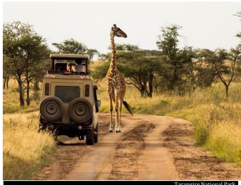
Tarangire National Park