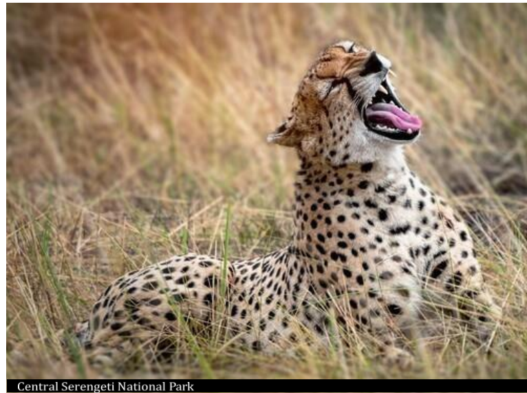
Central Serengeti National Park