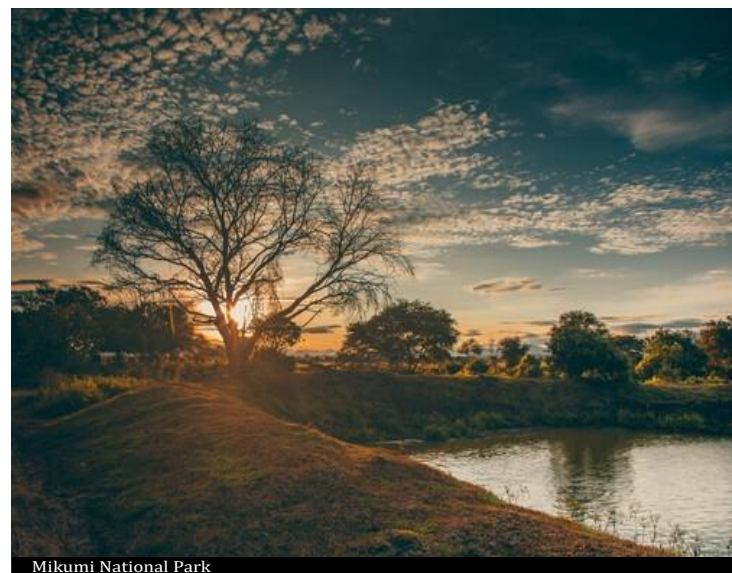
Mikumi National Park