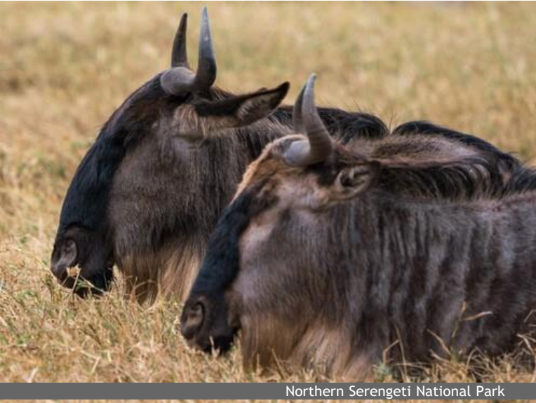
Northern Serengeti National Park

Return to the Northern Serengeti to enjoy further this area of the park.