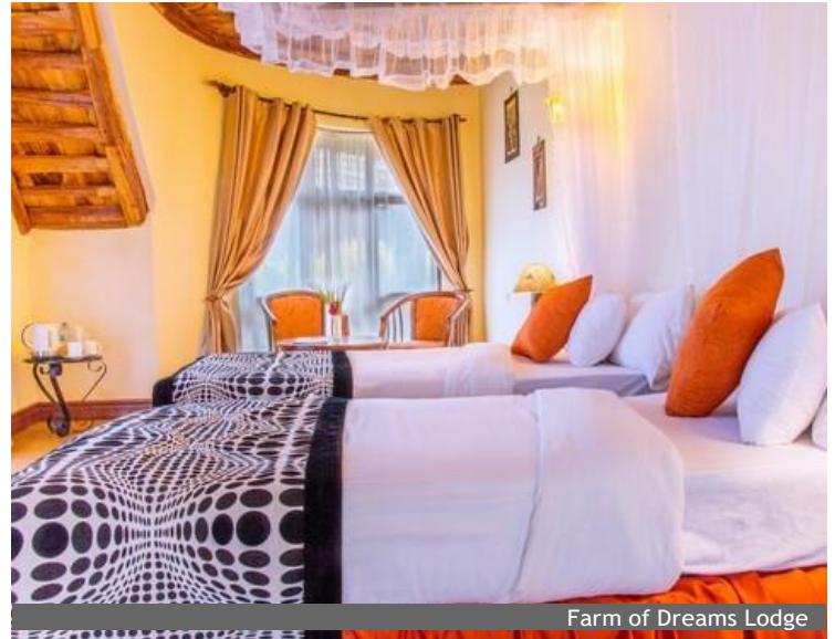
Farm of Dreams Lodge

Come back to Farm of Dreams Lodge to relax and enjoy the facilities again.