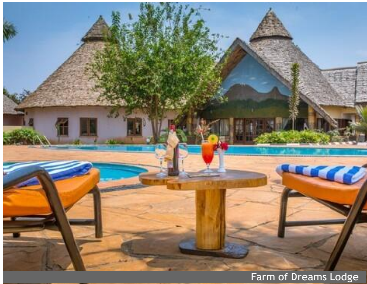
Farm of Dreams Lodge

Off the road that takes you between Lake Manyara and Ngorongoro Crater, Farm of Dreams Lodge has excellent rooms with wood-and-terracotta decor, mosquito nets and en suite bathrooms. The rooms inhabit manicured grounds with palm trees, and you can relax in the swimming pool, restaurant and bar. The whole property is down a side road away from the main road, and is lovely and quiet.