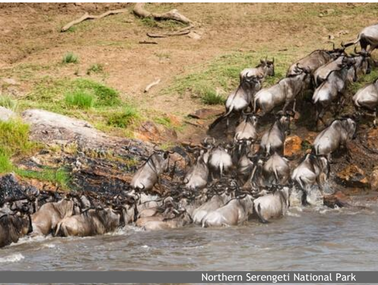
Northern Serengeti National Park