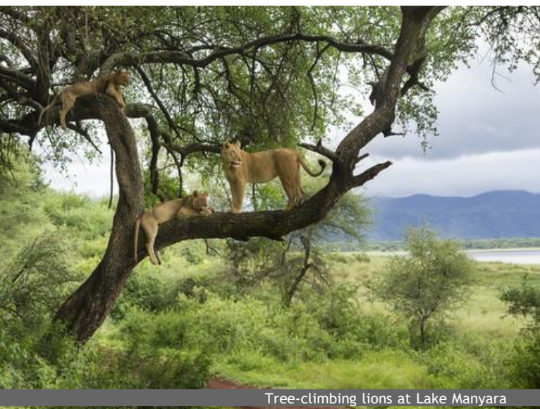
Tree-climbing lions at Lake Manyara

Lake Manyara is all about niche wildlife experiences: you'll look for tree-climbing lions, get really close to elephants, and gaze upwards at the cliffs of the Great Rift Valley.