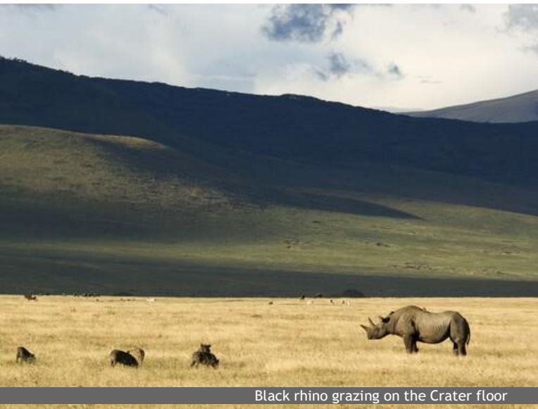
Black rhino grazing on the Crater floor