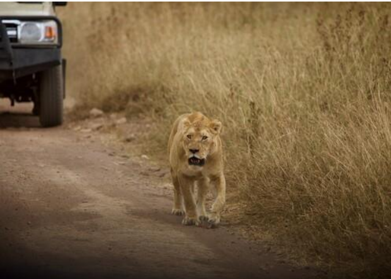
Northern Serengeti National Park

Imagine being out in the soft, early morning light, wrapped in a blanket, just as the animals emerge from their night's rest or from the shadows of their nighttime adventures. The world feels fresh and new on an early morning game drive, the sun has yet to beat down upon the earth, and it may end up being your favorite time to be out on safari.