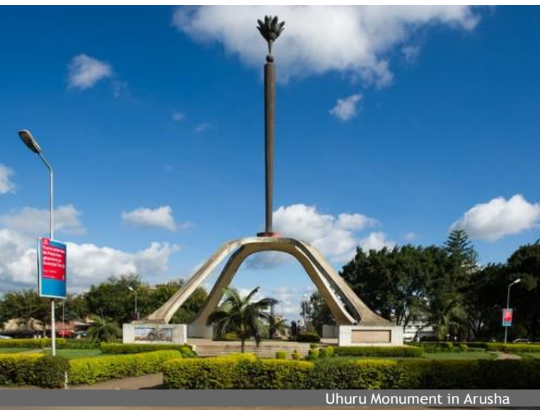
Uhuru Monument in Arusha

Busy Arusha is an essential part of safari life here in northern Tanzania and most travelers pass through at some stage. Whether you're on your way out on safari or here for a little longer, you'll catch a glimpse of streets filled with energy and color.