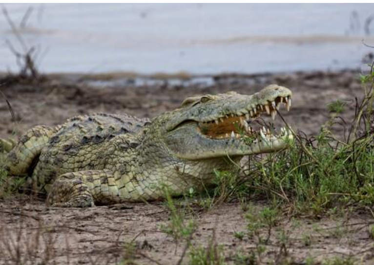
Nyerere National Park

Spend another night in Selous Mapumziko Lodge.