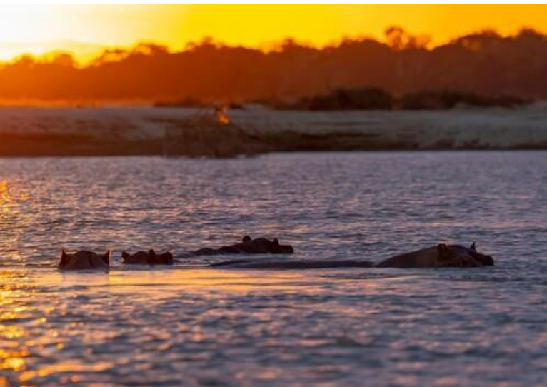
Nyerere National Park

Pass more time in Nyerere National Park, with its plentiful wildlife and landscapes you won't find anywhere else.