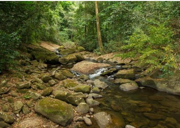
Forest stream in Udzungwa

Quite unlike any other park in Tanzania's east, Udzungwa Mountains National Park is where you get to go bird watching in the forest and look for the park's 10 species of primate. Udzungwa has more primate species than any other Tanzanian park. Udzungwa is an oasis of forested mountains, rich in birds and lush in its deep greens that contrast so strongly with the dry country that surrounds it in every direction. Elephants and hippos are commonly seen in the Kilombero floodplain, but it's the forest trails and Udzungwa's monkey populations that you'll most enjoy.