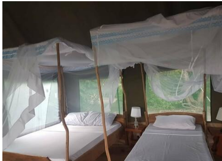
Selous Mapumziko Lodge

Spend another night in Selous Mapumziko Lodge.