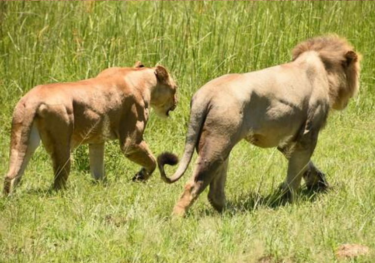
Mikumi National Park