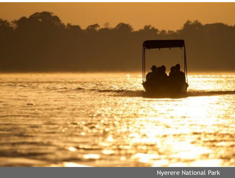
Nyerere National Park