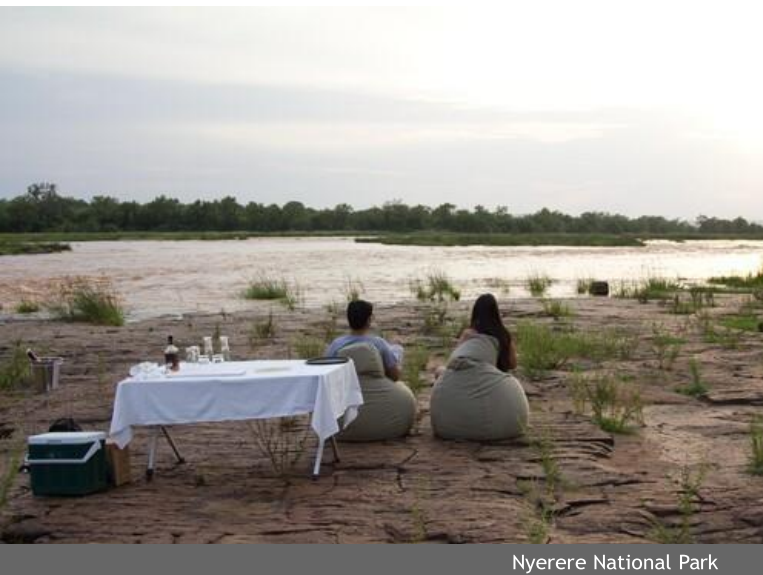
Nyerere National Park

Get to know one of Tanzania's most important national parks. Here you'll find lions – Nyerere National Park has one of Africa's biggest lion populations – elephants, crocodiles, zebras and lots of other safari animals present in large numbers. Hippos, giraffes, wildebeest and buffalo are also seen. And you might see leopards and African wild dogs if you're really lucky. Admire also the rugged landscape of rocky hills and lakes and the wide Rufiji River, all fringed with palm trees. Despite the Selous being one of the largest protected areas in East Africa, the area open for visitors is relatively small so you will enjoy a concentrated safari experience.