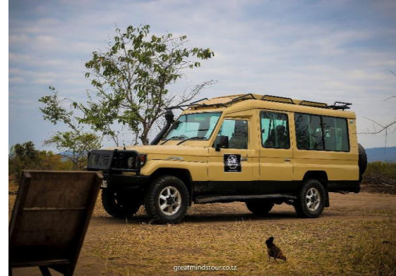
4 wheels (with pop up roof)