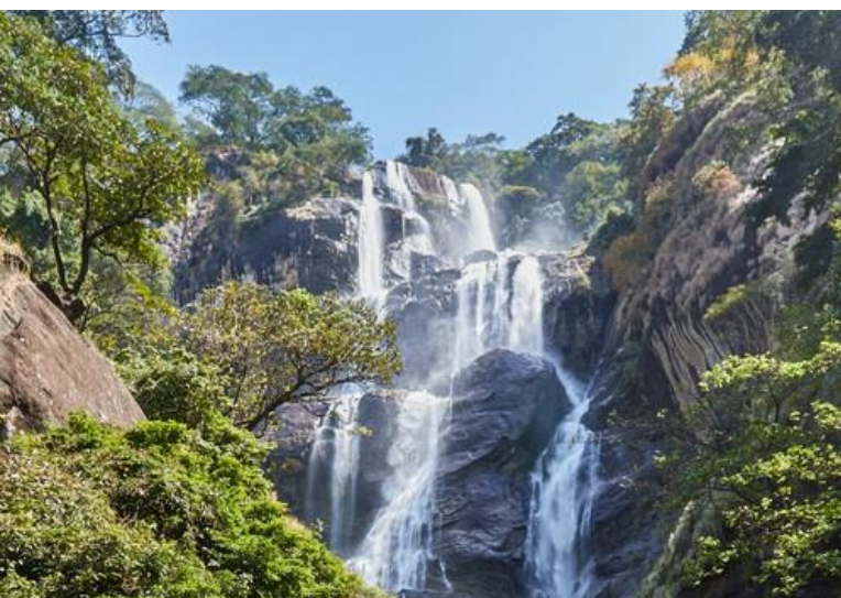
Udzungwa Mountains National Park

You'll stay at Camp Bastian Mikumi, which is a terrific base for exploring the park whose entrance is very close to here. The camp has good rooms in chalets, or a campground, which together draw a fun mix of travelers. You can also relax in the onsite restaurant or in the swimming pool. Trees fill the grounds, providing lots of shade.