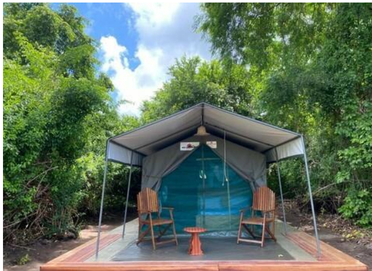
Selous Mapumziko Lodge

You're in for one of southern Tanzania's highlights when we take you out on a boat trip on the Rufiji River. It's a chance to enjoy being out on the water, watch the crocs and hippos, and scan the riverbank to see what other animals come down for a drink.