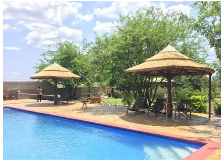
Camp Bastian Mikumi

You'll stay at Camp Bastian Mikumi, which is a terrific base for exploring the park whose entrance is very close to here. The camp has good rooms in chalets, or a campground, which together draw a fun mix of travelers. You can also relax in the onsite restaurant or in the swimming pool. Trees fill the grounds, providing lots of shade.