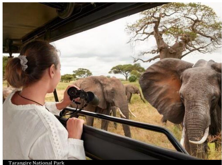
Tarangire National Park