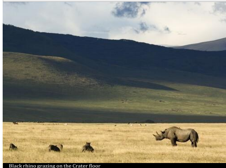
Black rhino grazing on the Crater floor