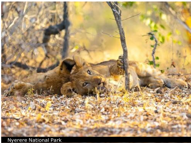
Nyerere National Park

Nyerere Park boasts of the largest concentration of wild animals and a rich collection of wildlife that is abundant and diverse. The fact that this park is new and largely less frequented by tourists means that the animals here tend to be less exposed to humans. Good numbers of Big Cats such as Lion, Leopard, Cheetah are to be found here along with other large Game animals such as Elephant, Rhino, Buffalo, Giraffe, Eland, Zebra, Wildebeest and other wildlife.