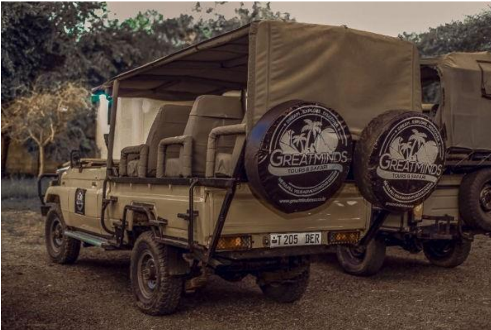
GM. open vehicle