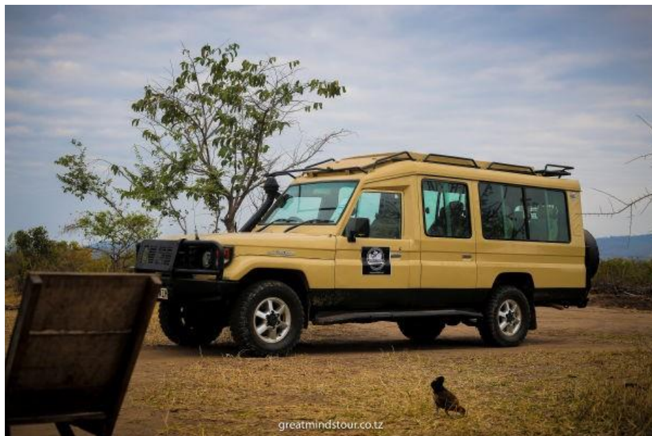
4 wheels (with pop up roof)