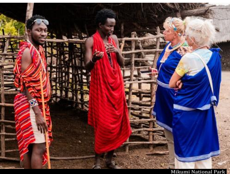
Mikumi National Park