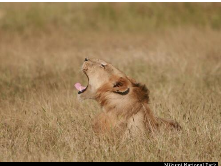
Mikumi National Park

Spending time in Mikumi National Park could just be one of your best safari surprises. It has all the wildlife you could wish for, including four of the Big Five – lion, leopard, elephant and buffalo. But your biggest prize of all may be finding a pack of endangered African wild dogs, which is always an exhilarating sight. You'll love the landscapes, too so many classic safari images including grassy plains, light woodlands and plenty of baobabs, that strangely wonderful tree of the African plains. Put it all together and you'll soon understand why they sometimes call Mikumi 'Little Serengeti'.